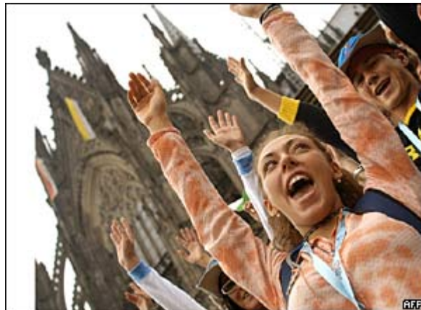
GUTEN TAG! Youth celebrate WYD in Cologne, Germany.

The whole experience was just incredible. I met new people who I now consider great friends, I developed a greater perspective on the world, and above all I came in closer touch with not only the human world, but also with the spiritual world. It's an experience I strongly recommend. Hopefully, I'll see you in Sydney.